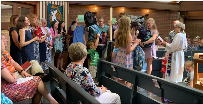
Blessing of the backpacks, students and teachers on Sunday, September 1

After a very successful series of Summer Camp weeks, our Preschool teachers and staff greeted new and returning children and parents the day after Labor Day! There were a lot of smiles as well as a few tears – from both children and parents.