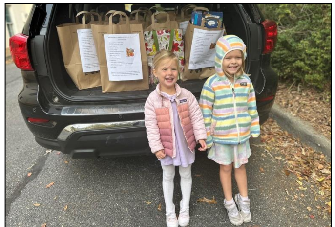
20 bags of food for FISH