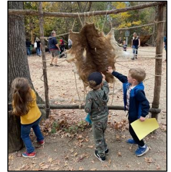
Exploring Jamestown Settlement