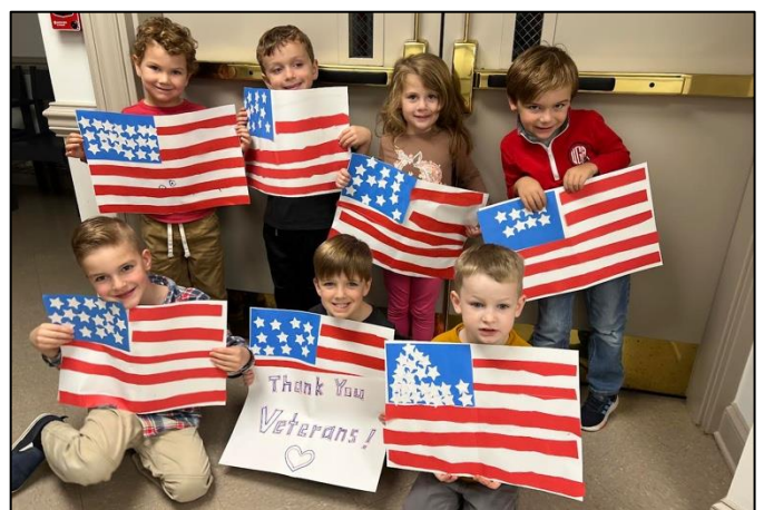
Celebrating Veteran's Day