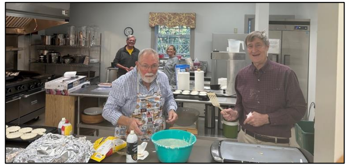
Pancakes in PJs Dinner – Kitchen Crew