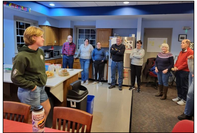
LSA Ice Cream Social on November 12