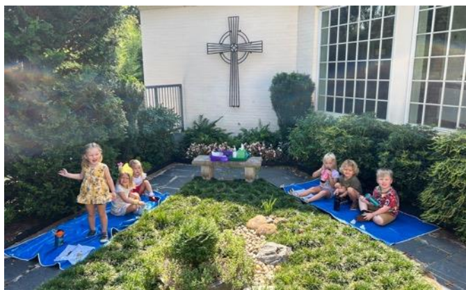
Students enjoying snack time in the Prayer Garden