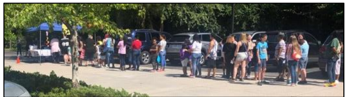
Lined up for sneakers and school supplies