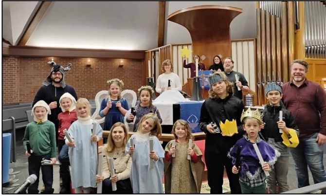
Our children and their parents present "At the Manger," A Chord Story with Chimes