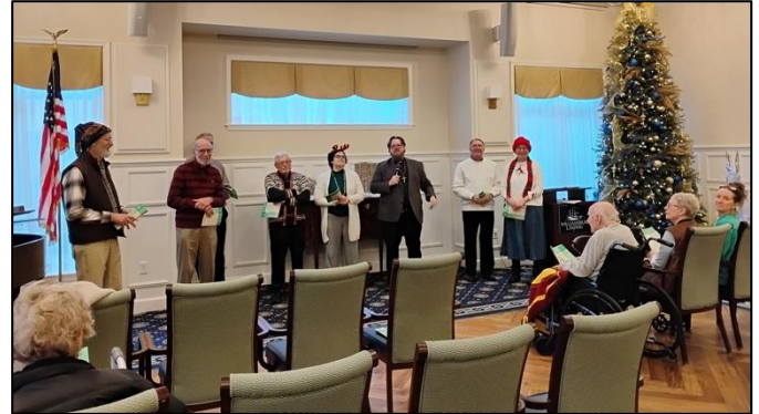
Christmas Caroling at Williamsburg Landing