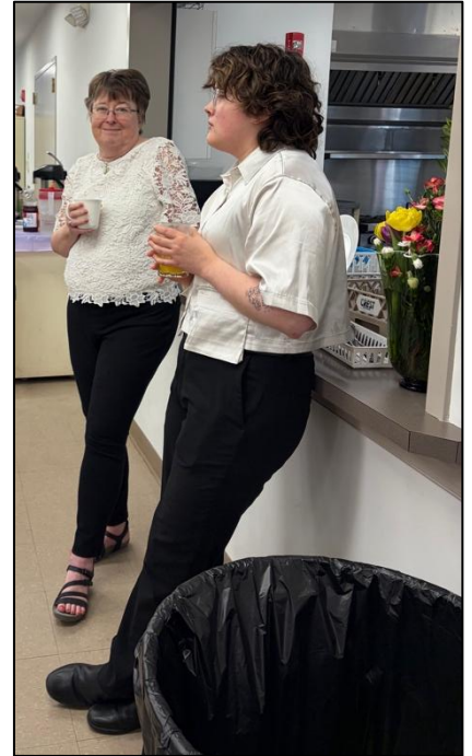
Fellowship at the Easter Potluck Breakfast between services on April 5